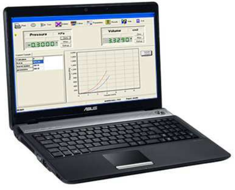
"Mullen" Index (kN/g, kPa.m²/g) Burst Resistance (kPa, PSI, Bar, Kg/cm²)